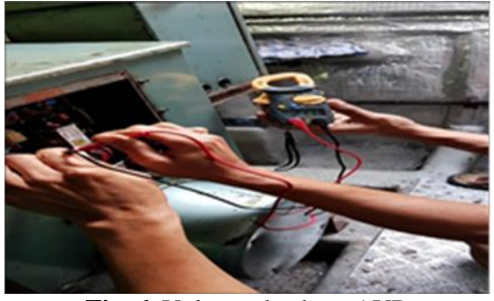
Fig. 6. Voltage check on AVR

From the results of checks made on the measurement of these generator components as a whole there are some differences from the data contained in the AVO meter measuring instrument showing the voltage generated for the three phases is in the range of numbers namely 360 - 392 Volts and for one phase in the numbers 210 - 230 Volts and for measurements after entering the electric panel also in numbers 360 - 392 Volts and 210-230 Volts, for the PMG system the stator entering into the AVR also shows normal numbers with voltages ranging from 150 Volts AC - 180 Volts AC and for the figures produced for engine speed when normal idle at 1500 RPM but when given a reduced load to 1300 - 1350 RPM to overcome so that the resulting voltage remains at 220 Volts the idle RPM is raised to 1600 RPM so that when given a load will drop to 1500 RPM, but this results in a voltage surge at the beginning of the engine is operated or also when the load is used to change such as the use of air conditioning while the compressor is working and not working there will be changes in engine speed so that the voltage also generated up and down, generator engine RPM often up and down or hunting causing unstable voltage. Changes in load conditions as the dynamic behavior of the system will cause changes in the current flowing in the generator system which causes changes in the voltage of the armature and the generator terminal.