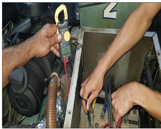
Fig. 5. Check the generator output voltage with neutral