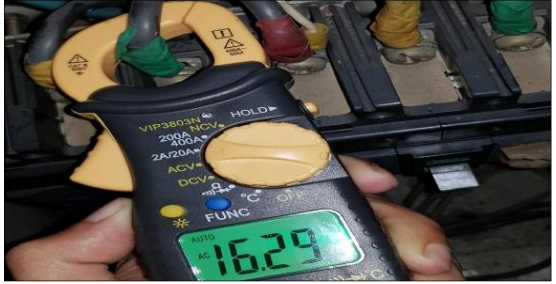
Fig. 3. Measurement of electric current and voltage

To analyze the electrical overload factor in the generator, data collection is done by measuring the amount of electric current (Ampere), voltage using a clamp meter, and the frequency (Hz) generated by the generator by observing the frequency meter on the electrical panel.