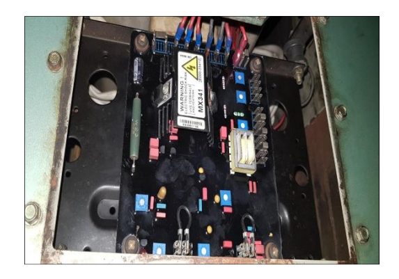
Fig. 2. AVR type MX341

To find out the cause of the damage to the AVR, an analysis of the factors that resulted in damage to the AVR on an electric generator on the ship. Factors resulting from the analysis are based on literature studies and direct observations on board and by looking at the history of the electrical system in the engine journal books, three factors cause AVR damage, namely: