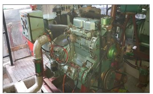
Fig. 1. Genset on KP. Hiu 06